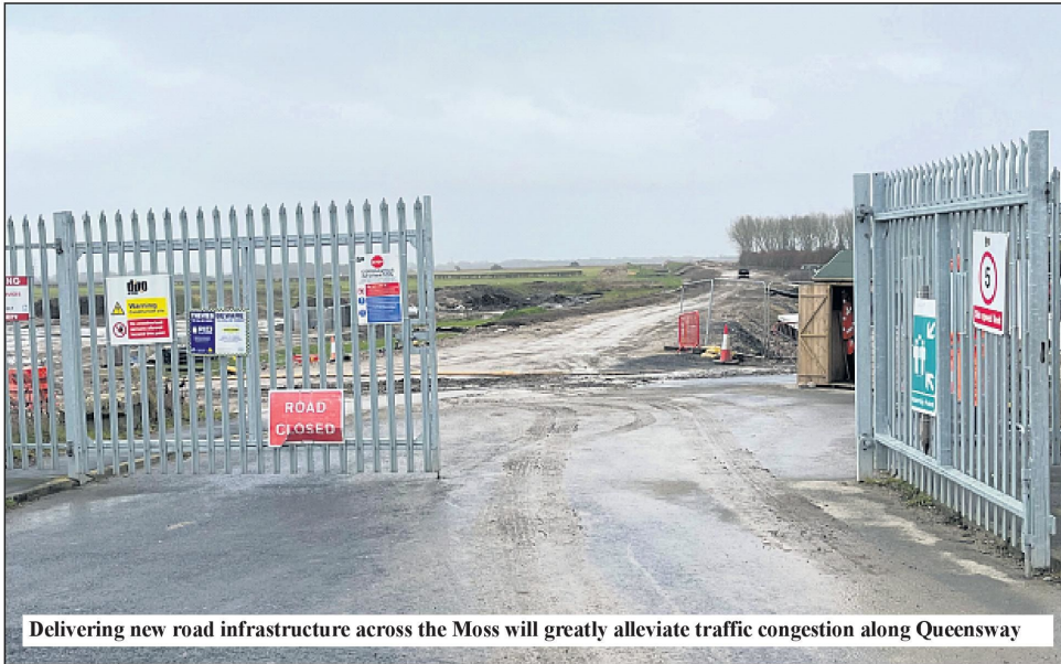
Delivering new road infrastructure across the Moss will greatly alleviate traffic congestion along Queensway