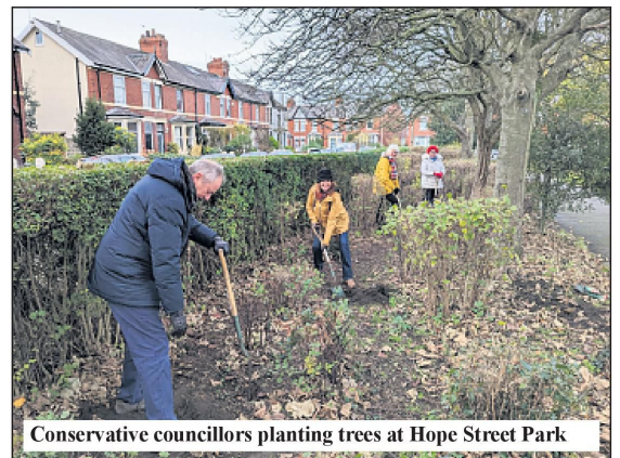
Conservative councillors planting trees at Hope Street Park

already started to recycle Christmas trees on the dunes, install hydration points to re-fill water bottles, a bucket and spade exchange on the beach, new electric fleet instead of diesel and extra electric vehicle charge points. Looking ahead, we have commissioned a carbon footprint study to benchmark future schemes against.