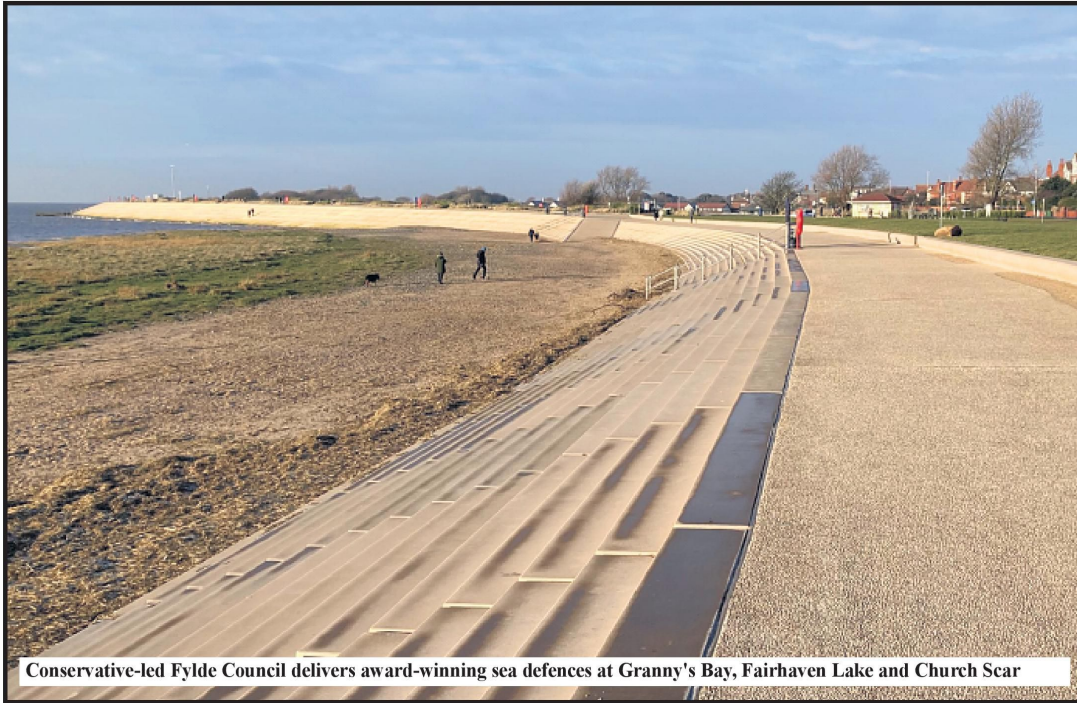
Conservative-led Fylde Council delivers award-winning sea defences at Granny's Bay, Fairhaven Lake and Church Scar

CONSERVATIVES: INVESTING IN THE FUTURE OF ST ANNES & FYLDE COAST