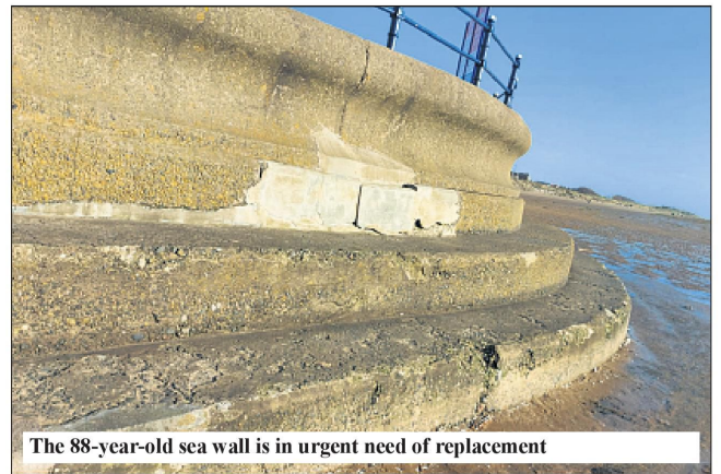
The 88-year-old sea wall is in urgent need of replacement