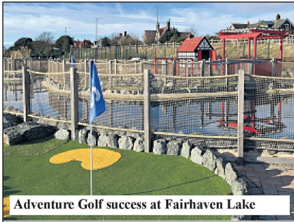
Adventure Golf success at Fairhaven Lake

Lytham St Annes Art Collection. We will be funding works to tackle flooding on the site to provide an overflow car park benefitting visitors to the Hall and to the town.