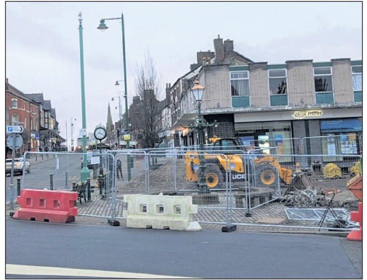
Work to regenerate Kirkham's Market Square started earlier this year

This, together with extra Covid grants in 2021/22 from the discretionary allocation, adds up to a further £117,500 supporting our rural communities.