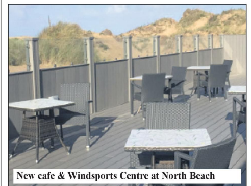
New cafe & Windsports Centre at North Beach

A Changing Places Toilet facility has also been installed and made available for public use as part of our ongoing commitment to provide accessibility for everyone.