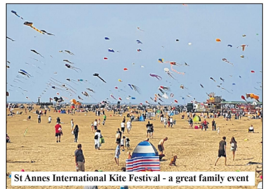
St Annes International Kite Festival - a great family event

Also in the budget for 22/23 is funding for a new beach hub near the pier providing a base for seasonal activities, a lost child point, first aid, rangers and beach wheelchair access.